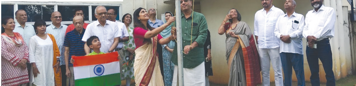
Rotary Club of Cochin celebrated the 77 th Indian Independence day by hoisting the Indian flag at Balbhavan.